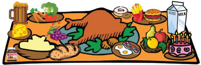
Food, Glorious Food

The Events Group is sponsoring a Carlyon Beach Cookbook to be published and for sale for Christmas 2024! We would like your favorite recipes and any short anecdotes, stories, or comments you have about our community. The recipes may be appetizers, main courses, salads, side dishes or desserts. We will hopefully have a section for each. There is a box down at the clubhouse to put your recipes in the slot.